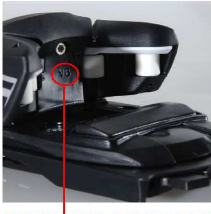
PRODUCTION DATE CODE LOCATION

Step 2: (If answered "YES" to Step 1 ) Inspect the toe component for a production date code found on the center plate where the toe of the ski boot contacts the toe component, as indicated in the following picture.